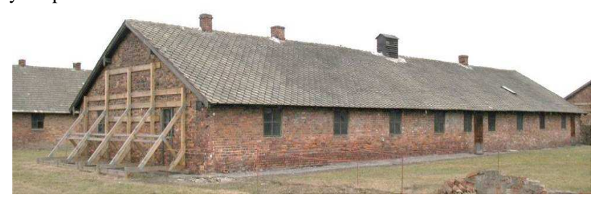
Fig 1. Prison barrack No. B-123

The accepted method of assessing the technical condition of buildings located in the area of the National Museum of Auschwitz-Birkenau in Oświęcim was presented on the basis of two prison barracks. Fig. 1 presents one of the analyzed prison barracks.