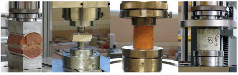
Fig. 2. Testing the compressive strength of the masonry wall, mortar, brick and concrete (from left)

Fig. 2 shows the methods of testing the compressive strength of materials taken from the structure accepted on the basis of literature [2].